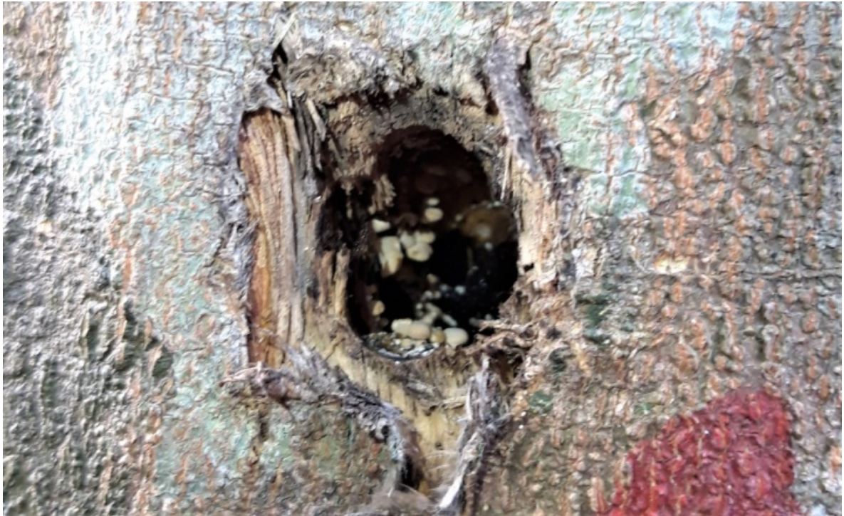
After six months of inoculation infection is spreading