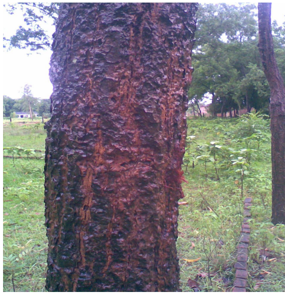
Bark of Shorea robusta