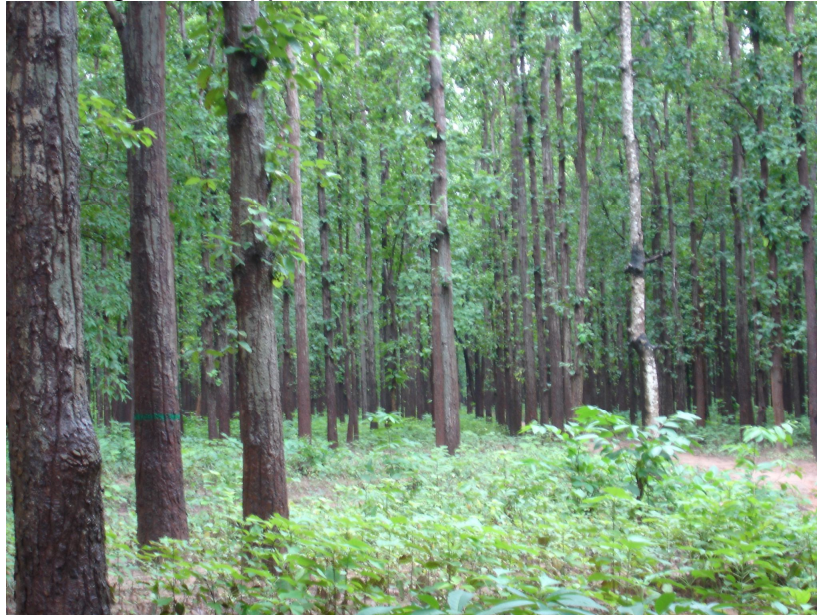
Sal Forests of Abhaya

U.P., Bihar, Jharkhad, Assam, Meghalaya and Tripura. In the central region, Sal occurs in Bihar, West Bengal, Orissa, M.P. and Chhatisgarh with isolated pocket in Andhra Pradesh. In West Bengal the natural forests are seen in the Northern West Bengal and in the South West Bengal the coppice Sal Forest can be seen.