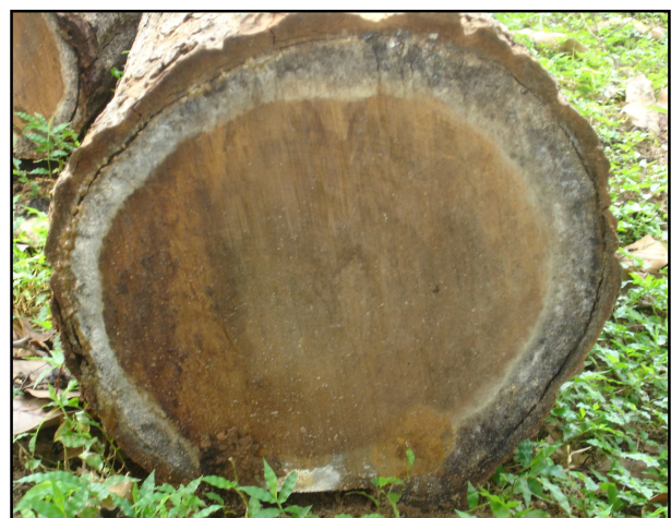
Heart wood of Shorea robusta